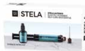
STELA AUTOMIX INTRO KIT - 8640002 1x 8g SYR, STELA PRIMER 5mL

If you are not 100% satisfied return the unopened product for a full refund.