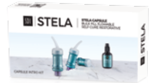
STELA CAPSULES INTRO KIT - 8640004 10 CAPS, STELA PRIMER 5mL