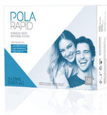
1 X POLA RAPID (3 PATIENT KIT)