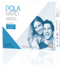
POLA RAPID (3 PATIENT KIT)