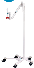
1 X POLA STAND