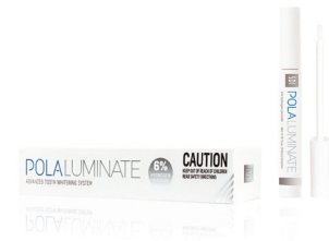
3 X POLA LUMINATE