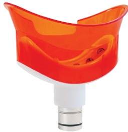
RADII XPERT BLEACH ARCH