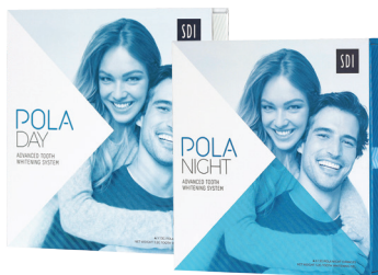
3 X POLA DAY OR POLA NIGHT 10 SYRINGE KITS